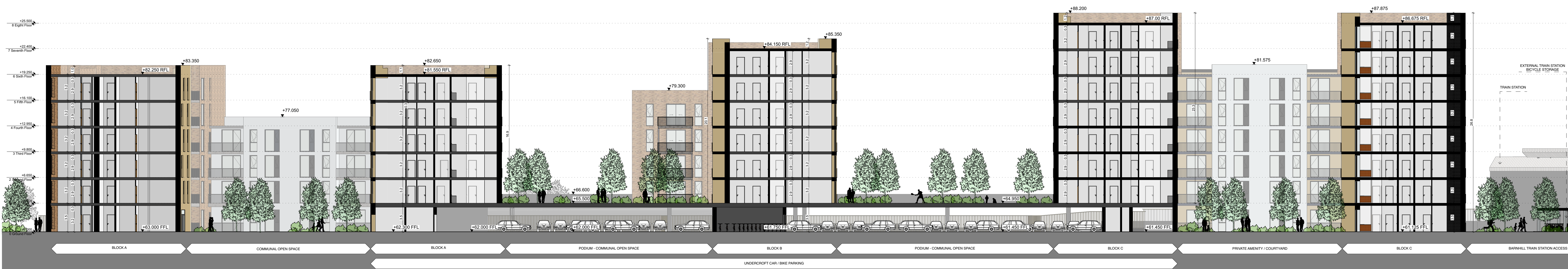
LONGITUDINAL SECTION SCALE 1:200