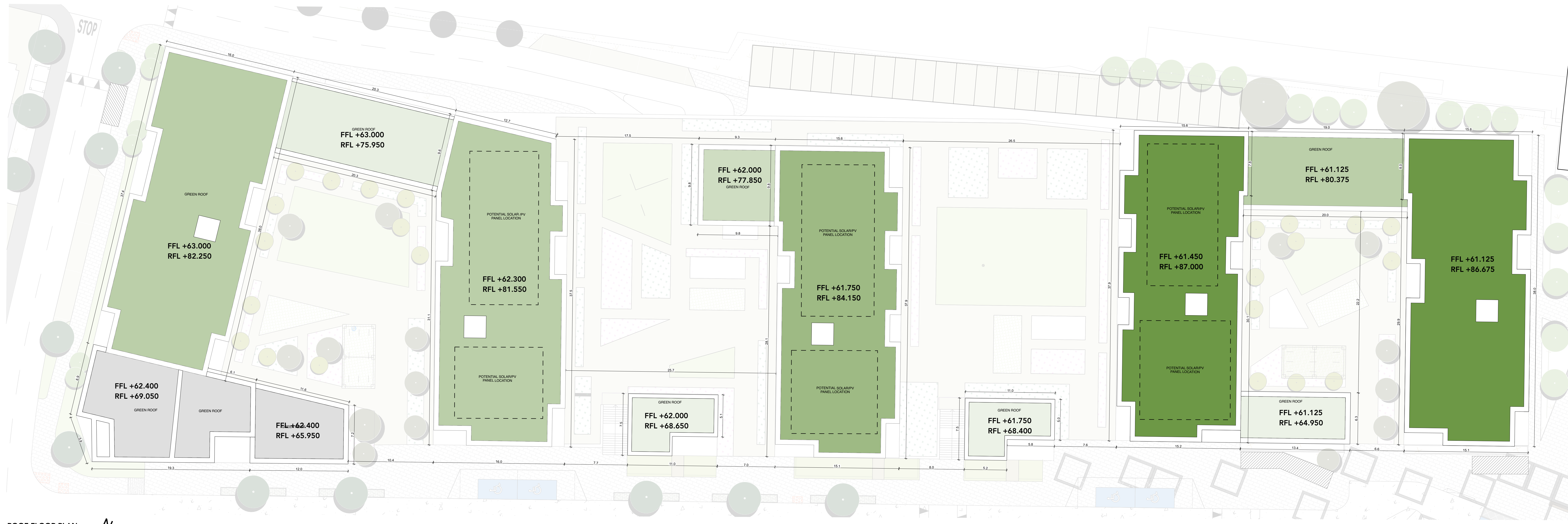
ROOF FLOOR PLAN SCALE 1:200

Notes Do not scale from this drawing. Use figured dimensions only. All errors and omissions to be reported to the Architect. This drawing is to be read in conjunction with relevant consultant's drawings. All dimensions are in millimetres and all levels are in meters to match Datums unless otherwise noted. This drawing is for planning purposes only and not for construction. This drawing or design may not be reproduced without permission.