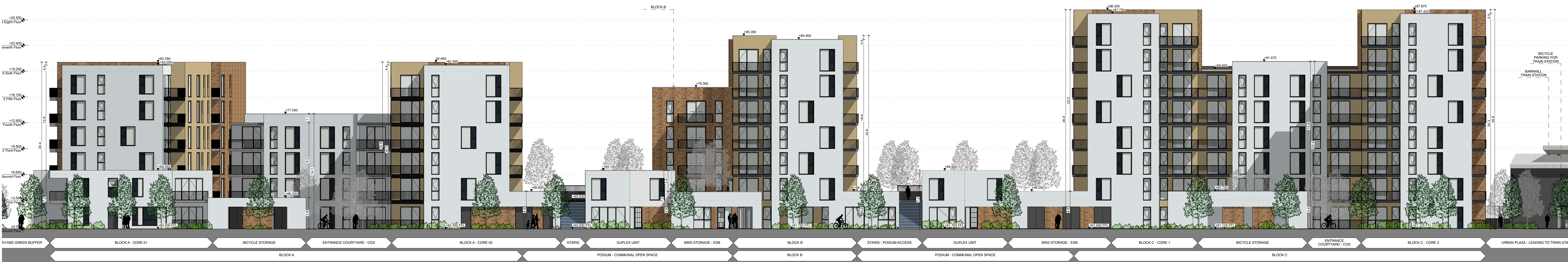
SOUTH ELEVATION SCALE 1:200